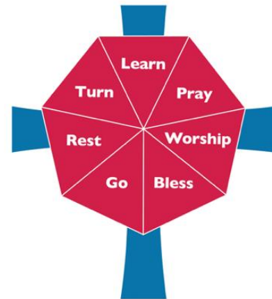
THE WAY OF LOVE Practices for Jesus-Centered Life

In worship, we can bring all of our selves before God, as a kind of offering. We can bring our hopes, our dreams, our joys and sorrows, our thanks and our praise. We can boldly proclaim ourselves to be who we are, and give public voice to what we believe, without reservation.